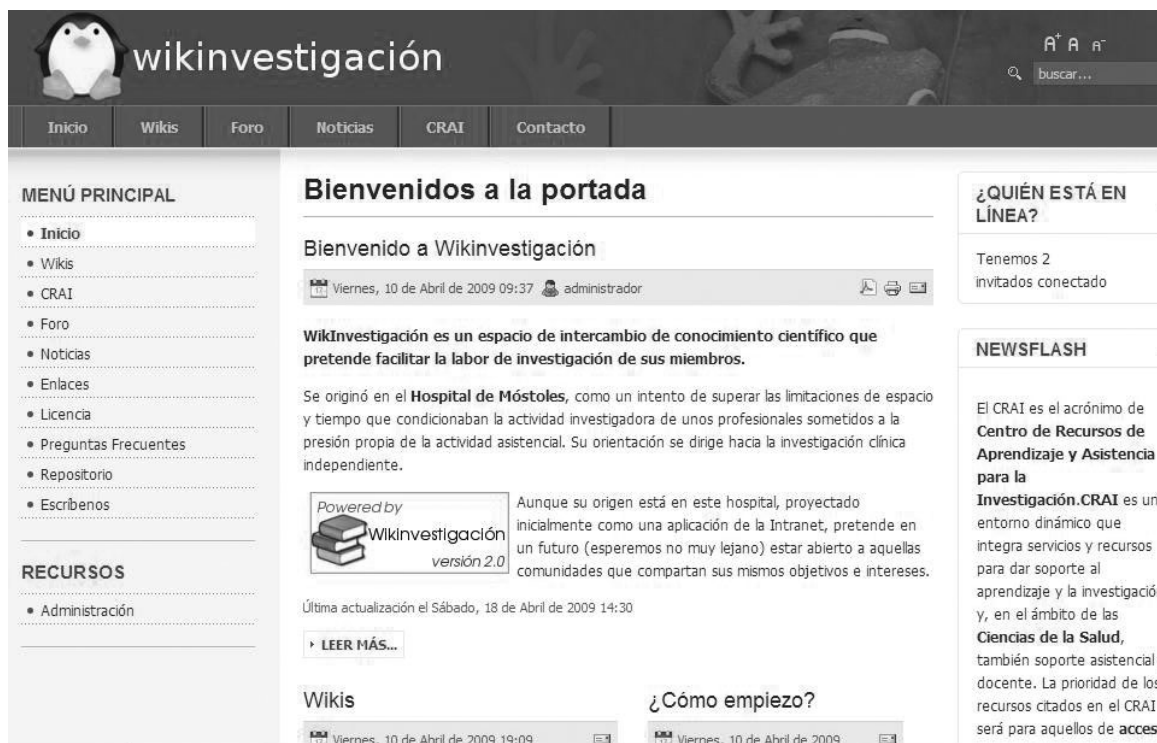
Figure 2 Portal wikinvestigación webspaces

contents, giving rise to the present WIKINVESTIGACION ( http://www.wikinvestigacion.org ).